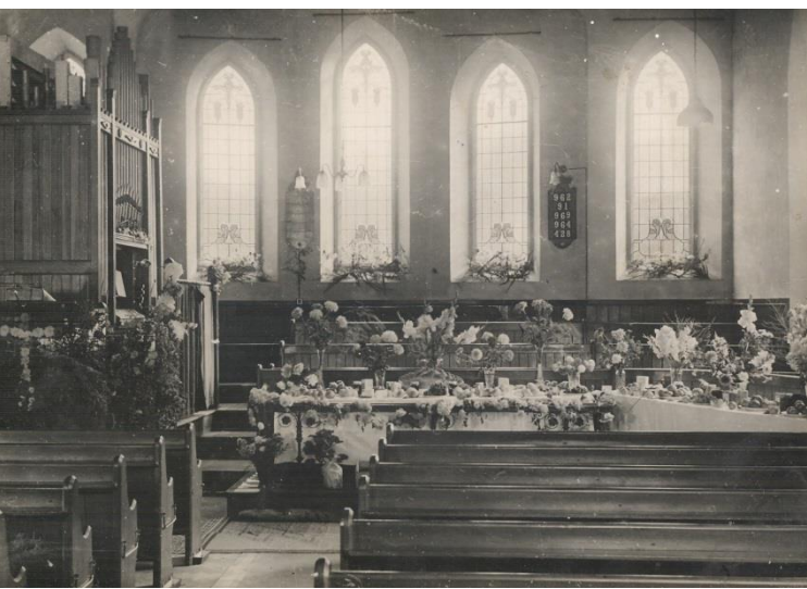
Harvest Festival at Stone's Cross

This new Society continued to flourish for many years with a strong Sunday school, a Ladies Guild, a Choir and an active Christian Endeavour. However, over the ensuing years, because of a decline in membership it was agreed, in 1963, that the chapel should be closed and the members transferred to the High Street Church.