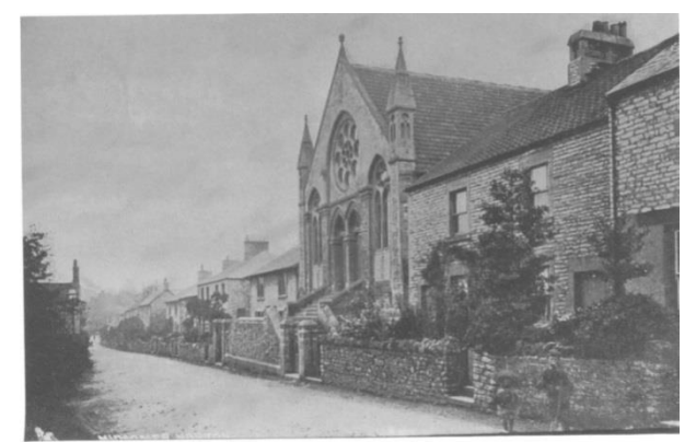
Redfield Road Church