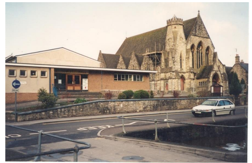
The Church Hall 1957 – 1996