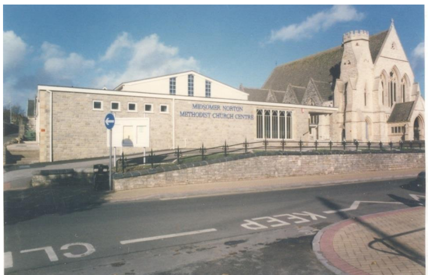
The new Midsomer Norton Methodist Church Centre 1996

After completion of the refurbishment of the church, building work was started in 1995 on the second phase. The design, undertaken by David Beresford-Smith involved a complete remodelling and modernisation of the original hall together with the construction of a link building to connect with the church. The outside of the building being faced with reconstructed stone which would eventually weather to match the church. The old stage in the hall was then removed giving a larger floor area and four new toilets were installed together with a fully equipped kitchen.