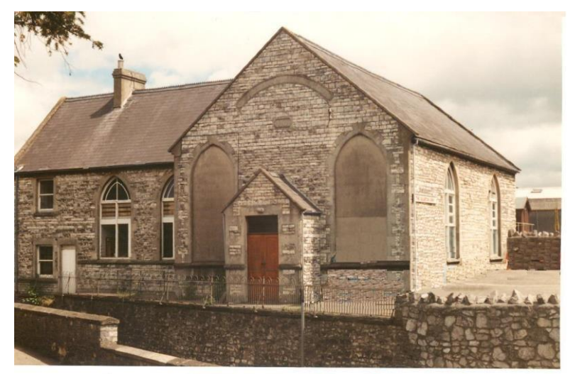
Stones Cross Chapel 1907 – 1963

In the early years of the 20th Century, the Primitive Methodist Society at Welton decided to build a Mission Chapel at Stones Cross. However, during the construction of this new building, many of the new members decided to leave Welton and form a new Society at Stones Cross; As a result, a new trust was formed.